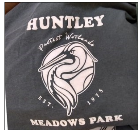
Logo on short- and long-sleeved shirts.

You can check our Facebook page www.facebook.com/friendsofhuntleymeadowspark for the next pop-up event date. See you in spring.