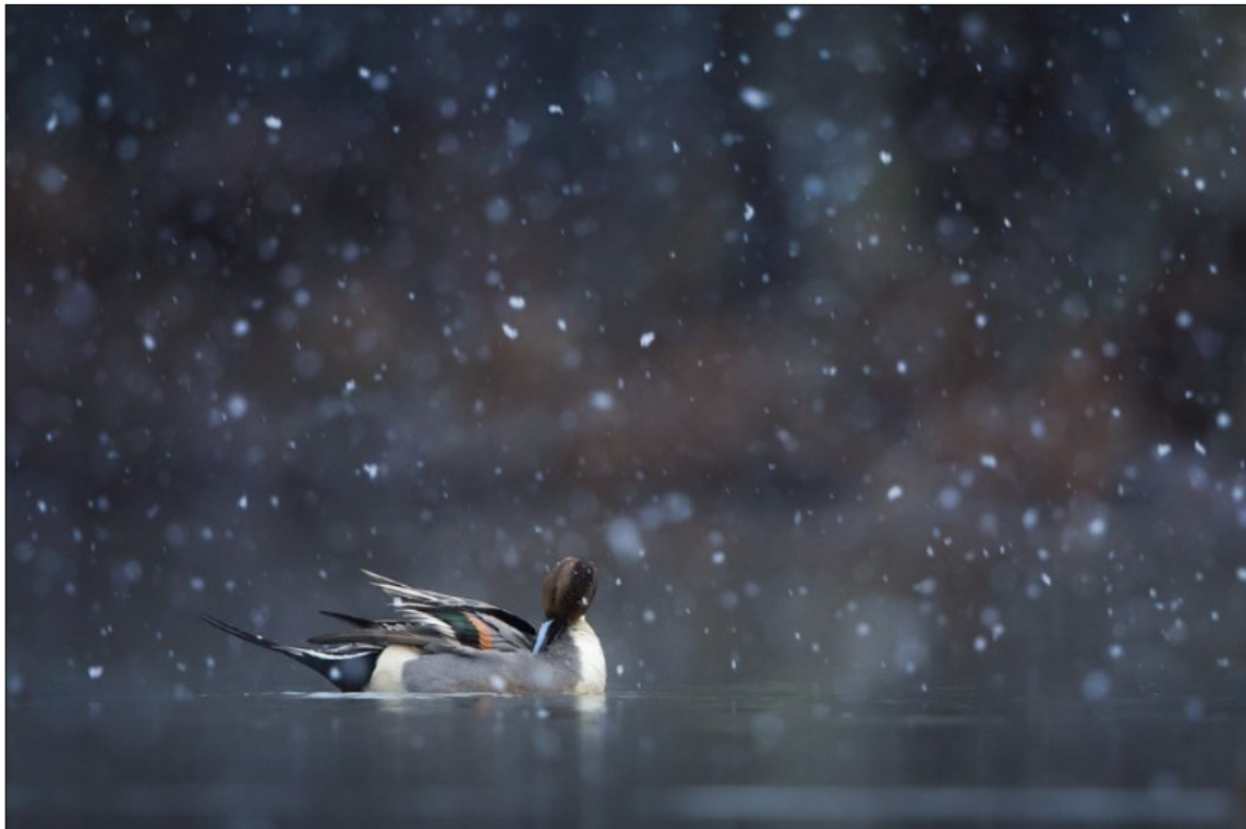
First Place Winner

The judges thought this snap was perfectly positioned and appreciated the pop of color among muted grays and falling snow. The picture captures the stillness and peacefulness of a snowy day on the water.