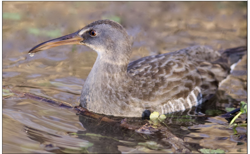
Clapper Rail swimming in HMP central wetland photographed by Ed Eder in late fall 2020.

Budgetary Implications: As a result of the pandemic, spending priorities have shifted towards emergency funding areas; other budgets have been slashed, and support services are strained. This shift of resources has unfortunately resulted in less funding for many Fairfax County parks and natural areas, including HMP. The severe disconnect between the importance of natural areas and how they are funded has become even more glaringly obvious during the pandemic. One way to help reduce this disconnect is for more of us to advocate for adequate funding for proper management of our natural resource areas. The next series of budget hearings at which we can advocate for more funding for FCPA parks is coming this spring. Stay tuned for the timing of these hearings. Each of us can take action by providing testimony.