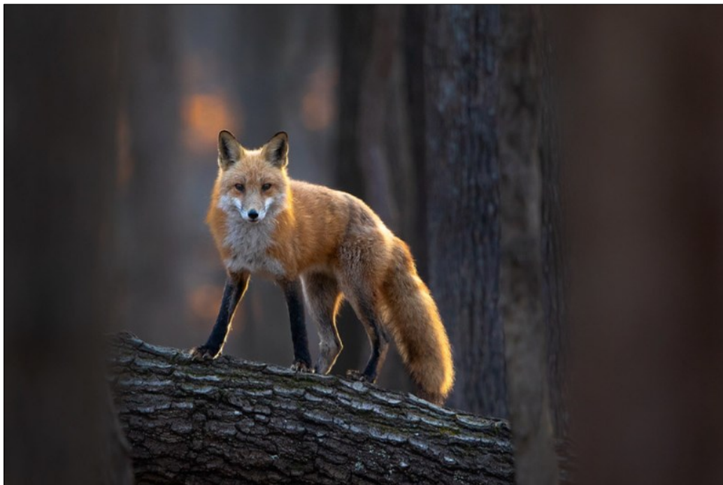
Third Place Winner